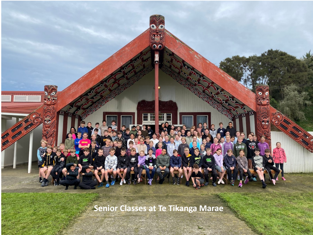
Senior Classes at Te Tikanga Marae