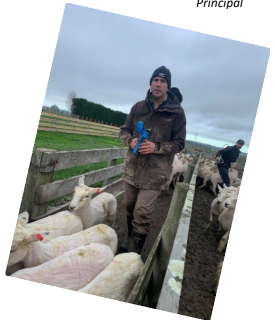
School parents and community helpers hard at work at Addenbrookes' farm last Sunday. Thanks to everyone involved.