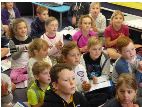
Rooms 3 and 8 enjoying Buddy Class reading