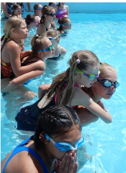
Rooms 2 and 6 enjoy Buddy Class swimming