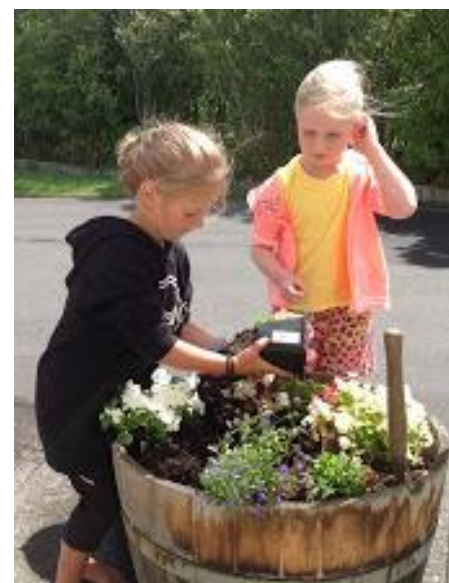
Room 2 children planting their barrel.