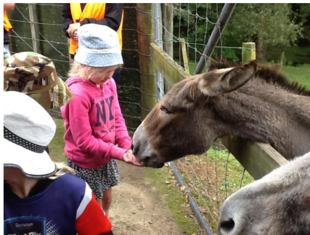
Rooms 1 and 2 visited Owlcatraz